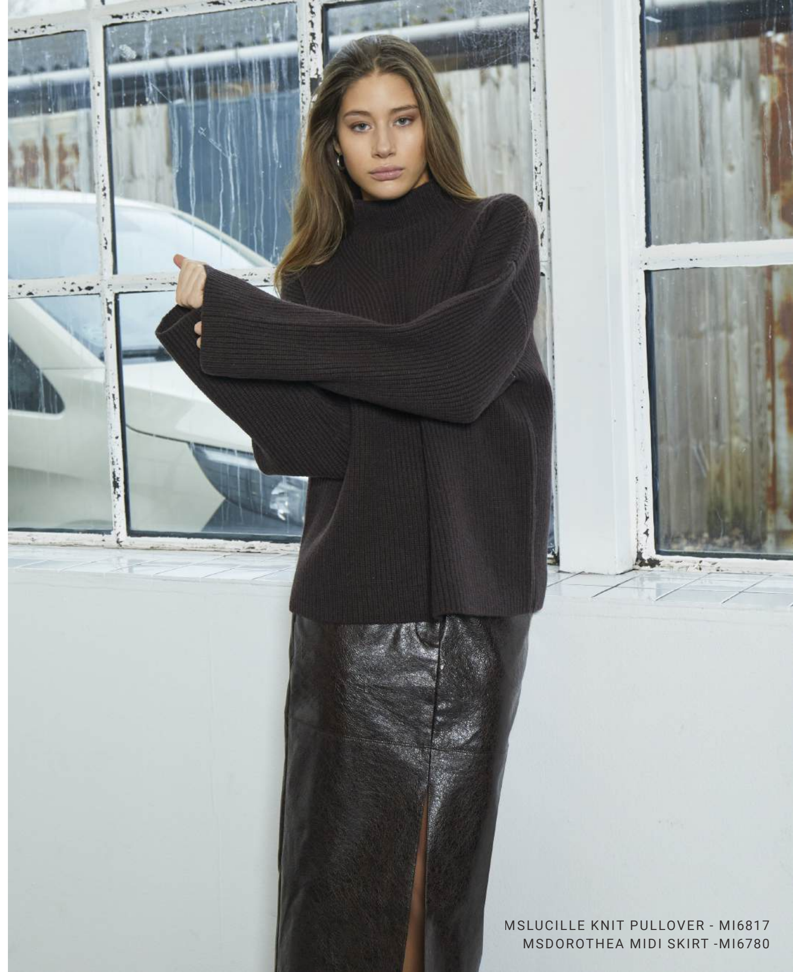
MSLUCILLE KNIT PULLOVER - MI6817 MSDOROTHEA MIDI SKIRT -MI6780