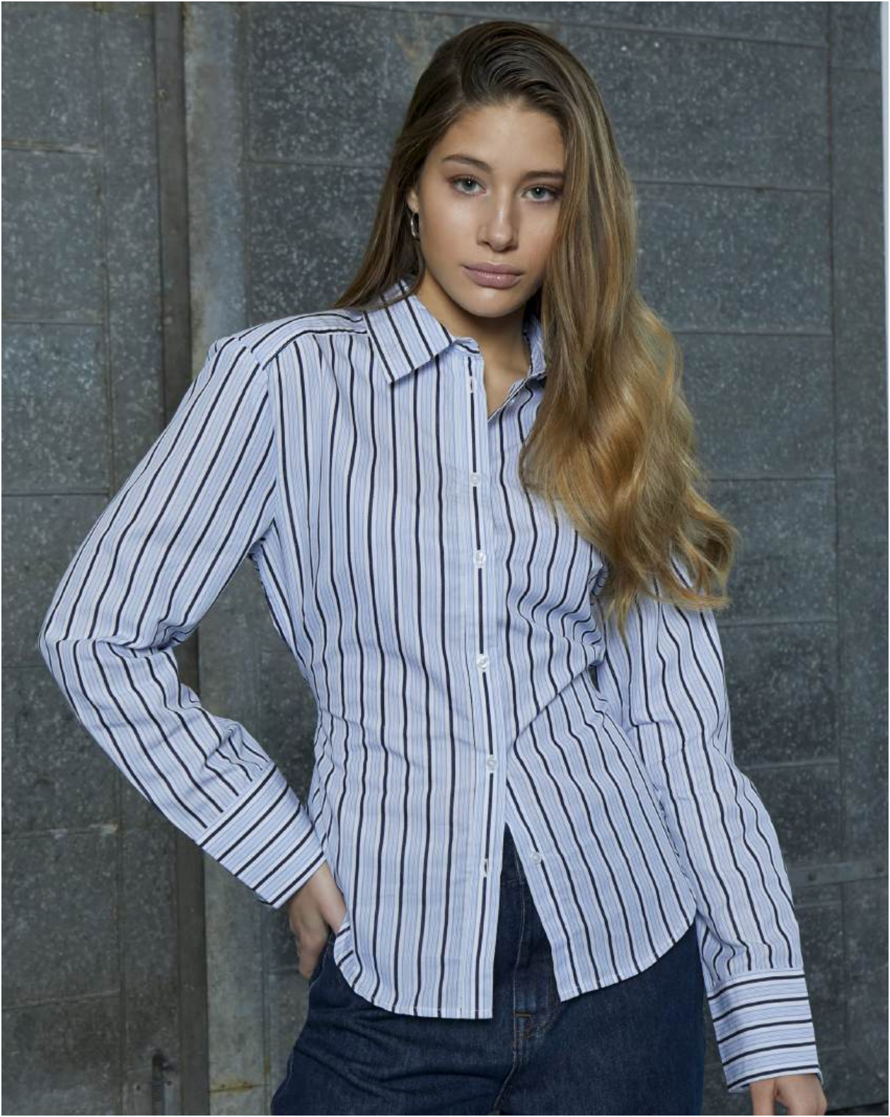
MSJENNI SHIRT - MI6781 MSBORA FOLD UP PANT - MI6777