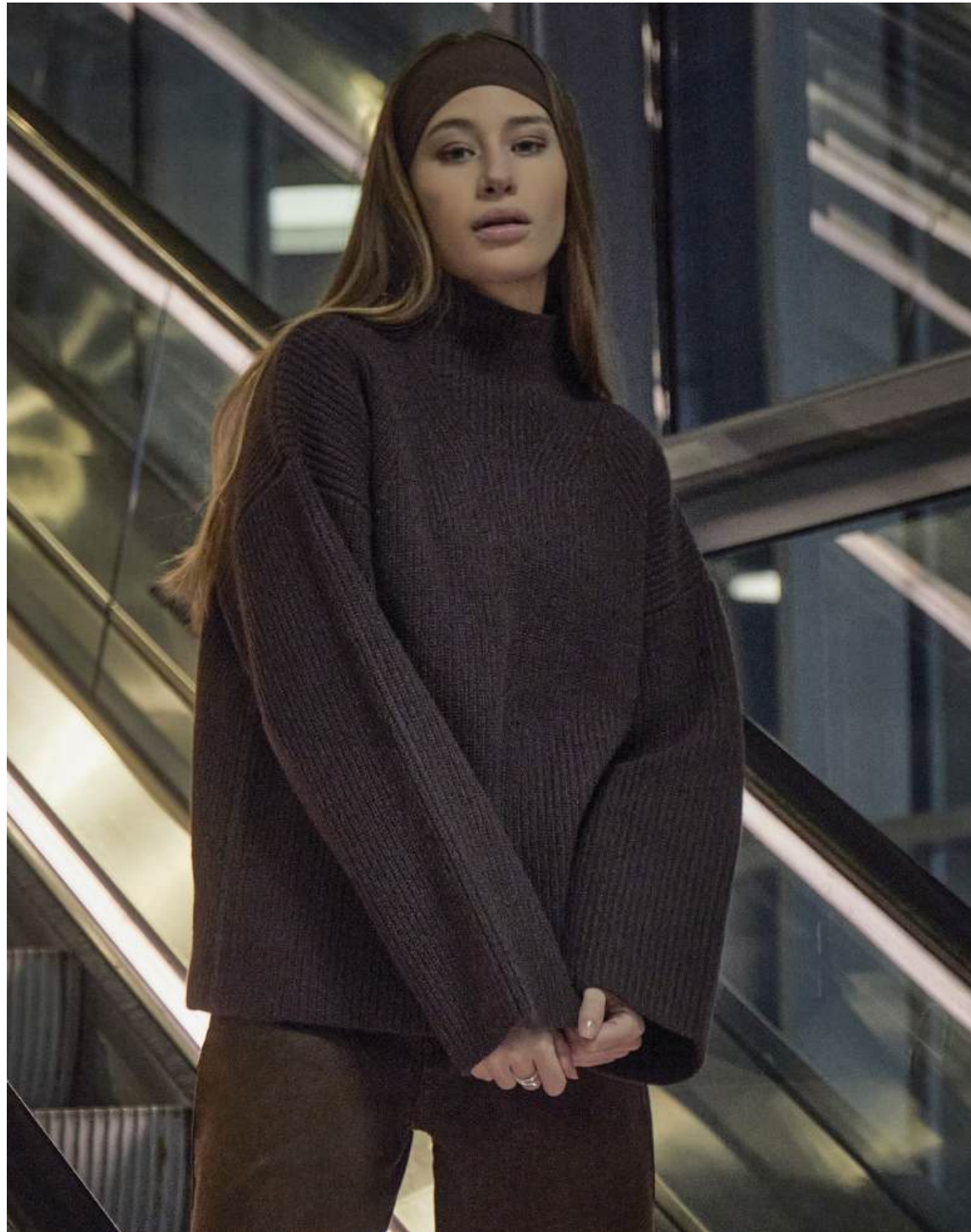
MSLUCILLE KNIT PULLOVER - MI6817 MSTIA MID WAIST PANT - MI6741