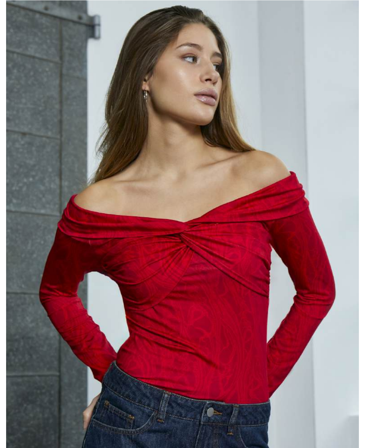
MSNALIMA LONG SLEEVE T-SHIRT - MI6765 MSBORA FOLD UP PANT - MI6777