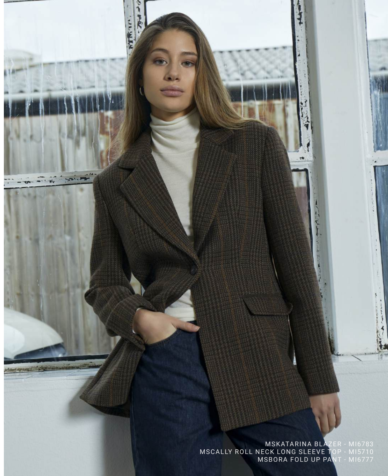
MSKATARINA BLAZER - MI6783 MSCALLY ROLL NECK LONG SLEEVE TOP - MI5710 MSBORA FOLD UP PANT - MI6777