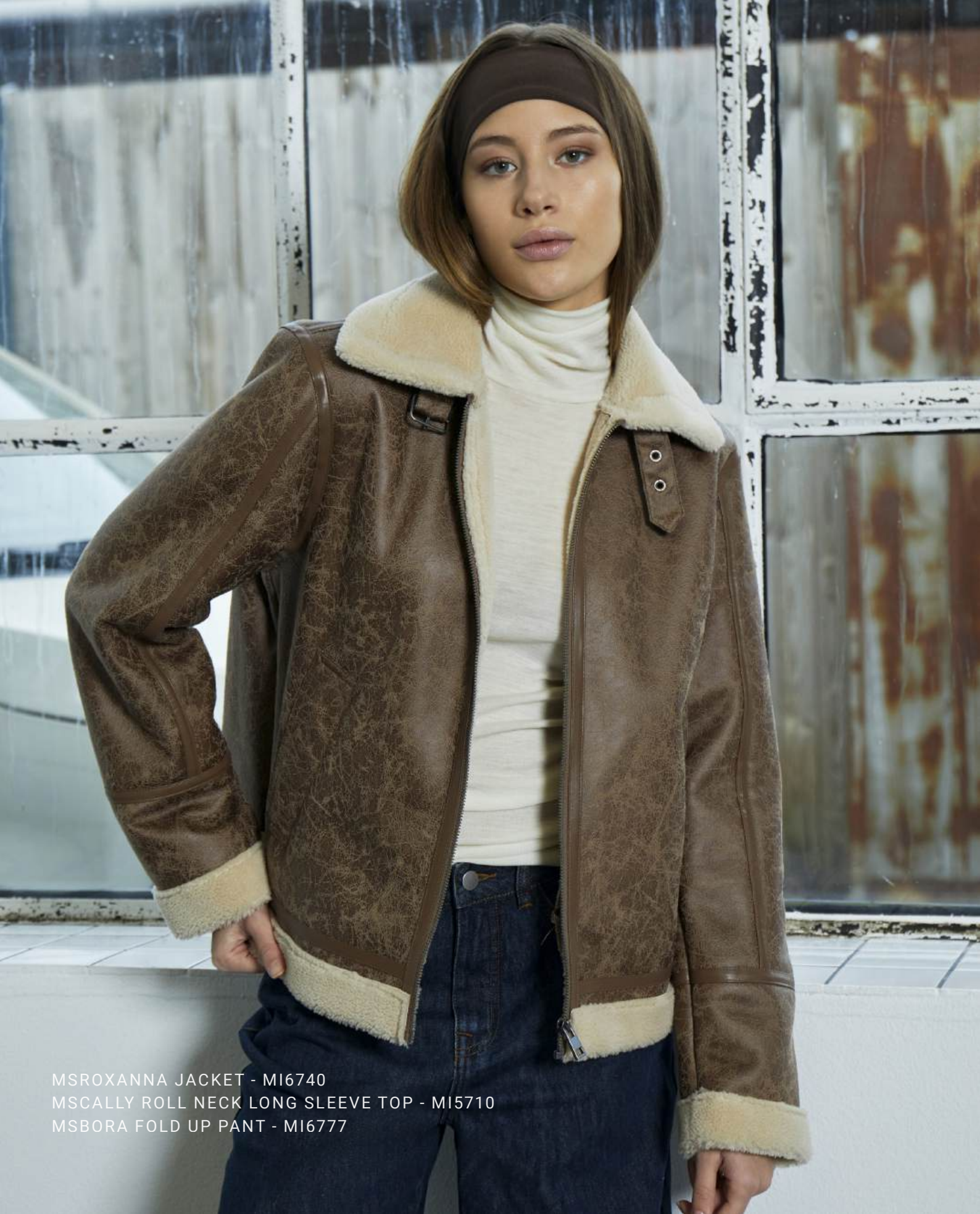
MSROXANNA JACKET - MI6740 MSCALLY ROLL NECK LONG SLEEVE TOP - MI5710 MSBORA FOLD UP PANT - MI6777