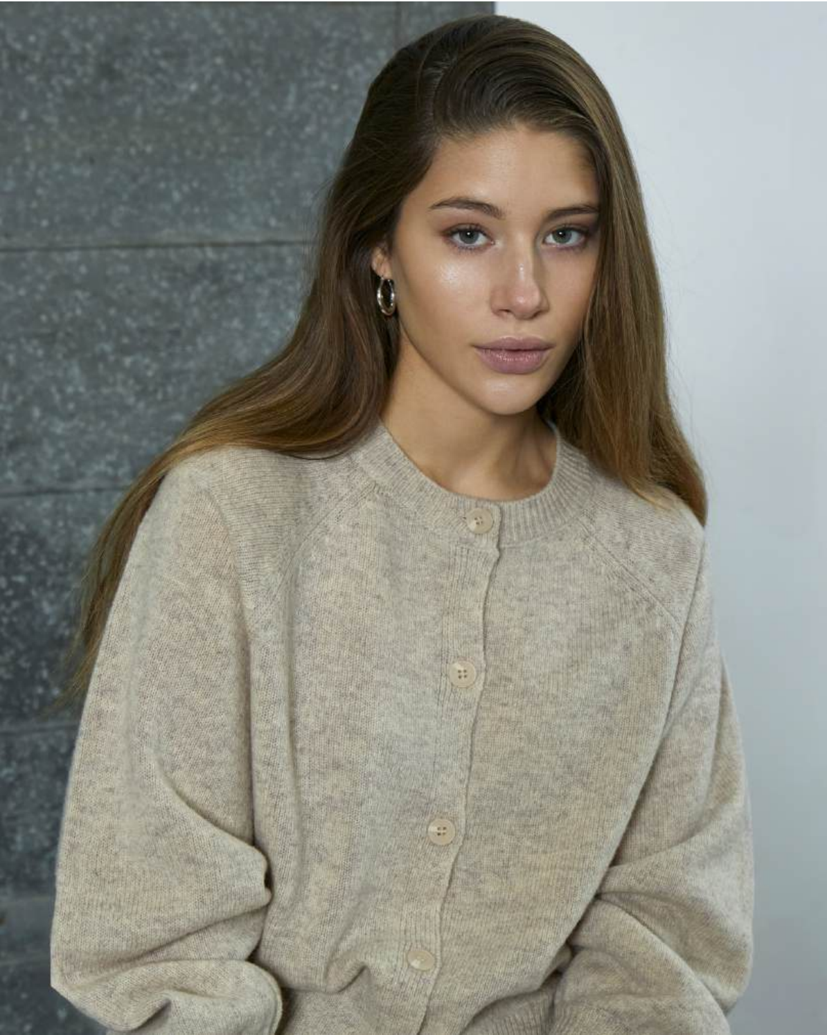
MSKENNA KNIT CARDIGAN - MI6745