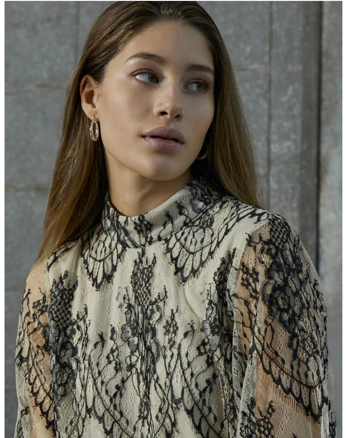
MSLIREA LACE BLOUSE - MI6759