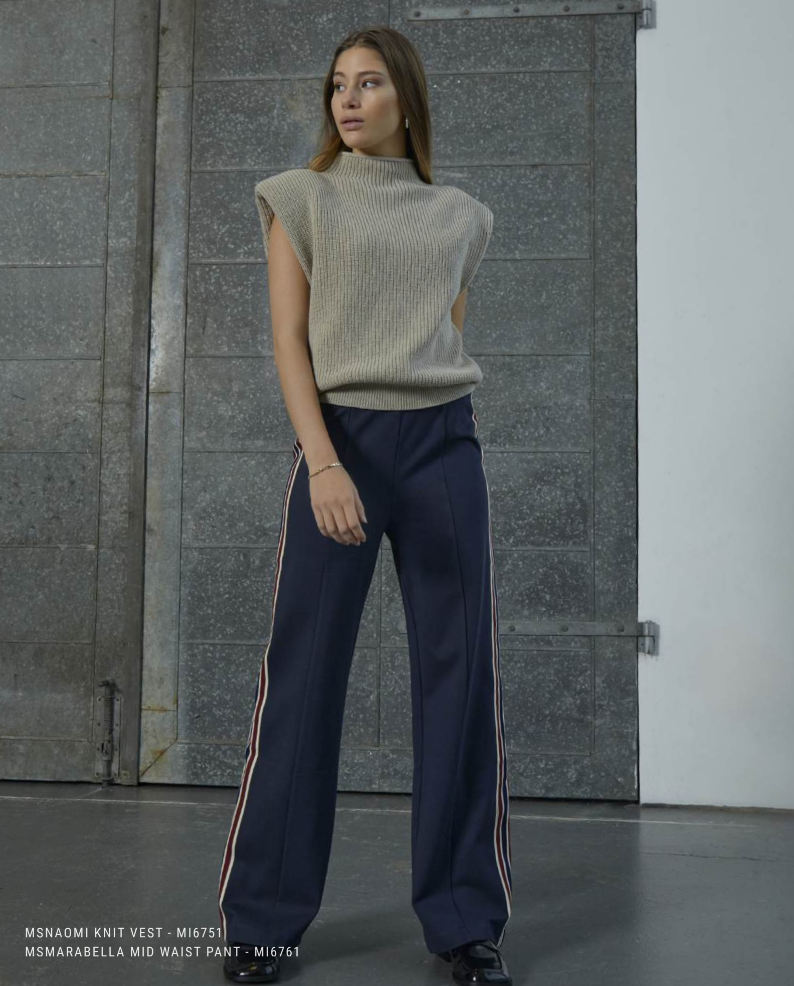
MSNAOMI KNIT VEST - MI6751 MSMARABELLA MID WAIST PANT - MI6761