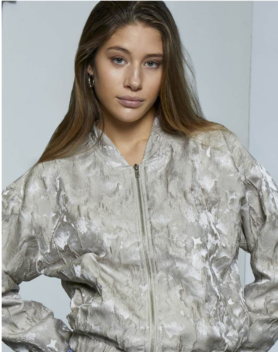
MSMIRELLE SHORT JACKET - MI6867