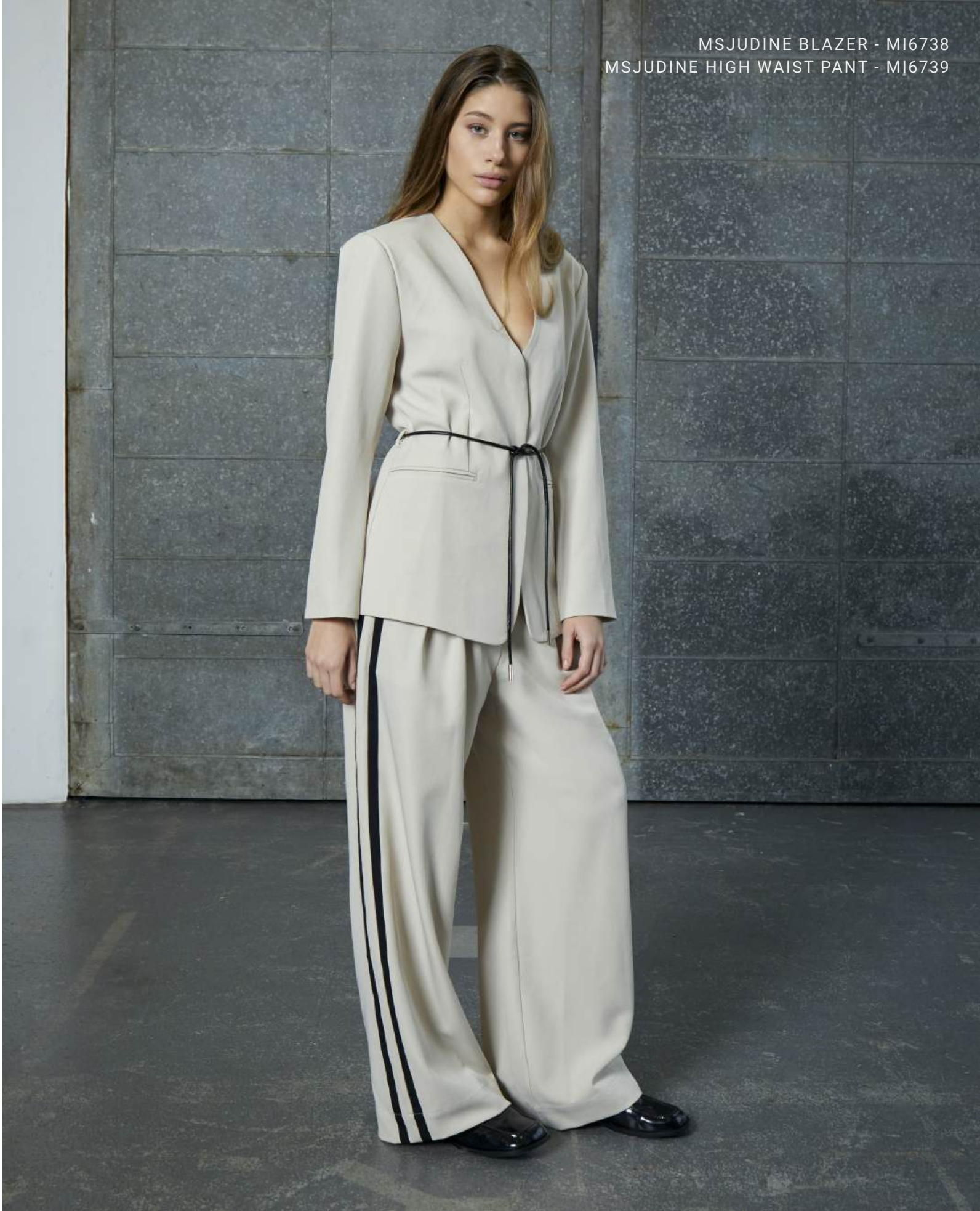
MSJUDINE BLAZER - MI6738 MSJUDINE HIGH WAIST PANT - MI6739