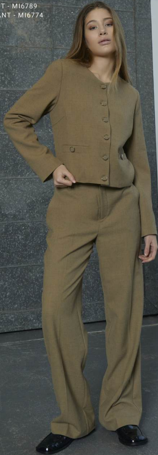
MSAYA SHORT JACKET - MI6789 MSAYA MID WAIST PANT - MI6774