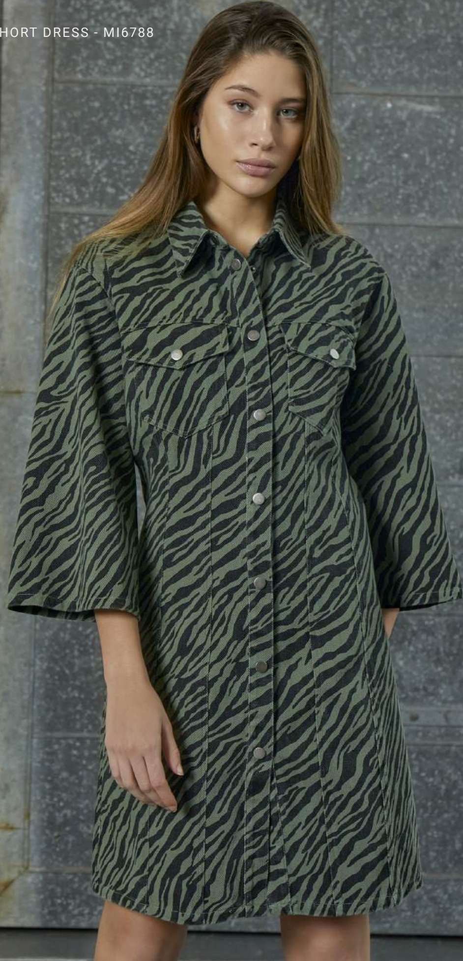
MSOLENNA SHORT DRESS - MI6788