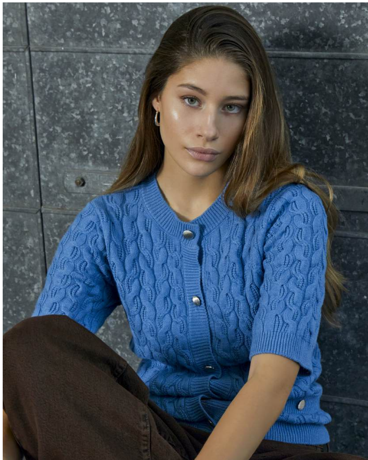
MSFILUCCA KNIT CARDIGAN - MI6726 MSDILARA MID WAIST JEANS - MI6869