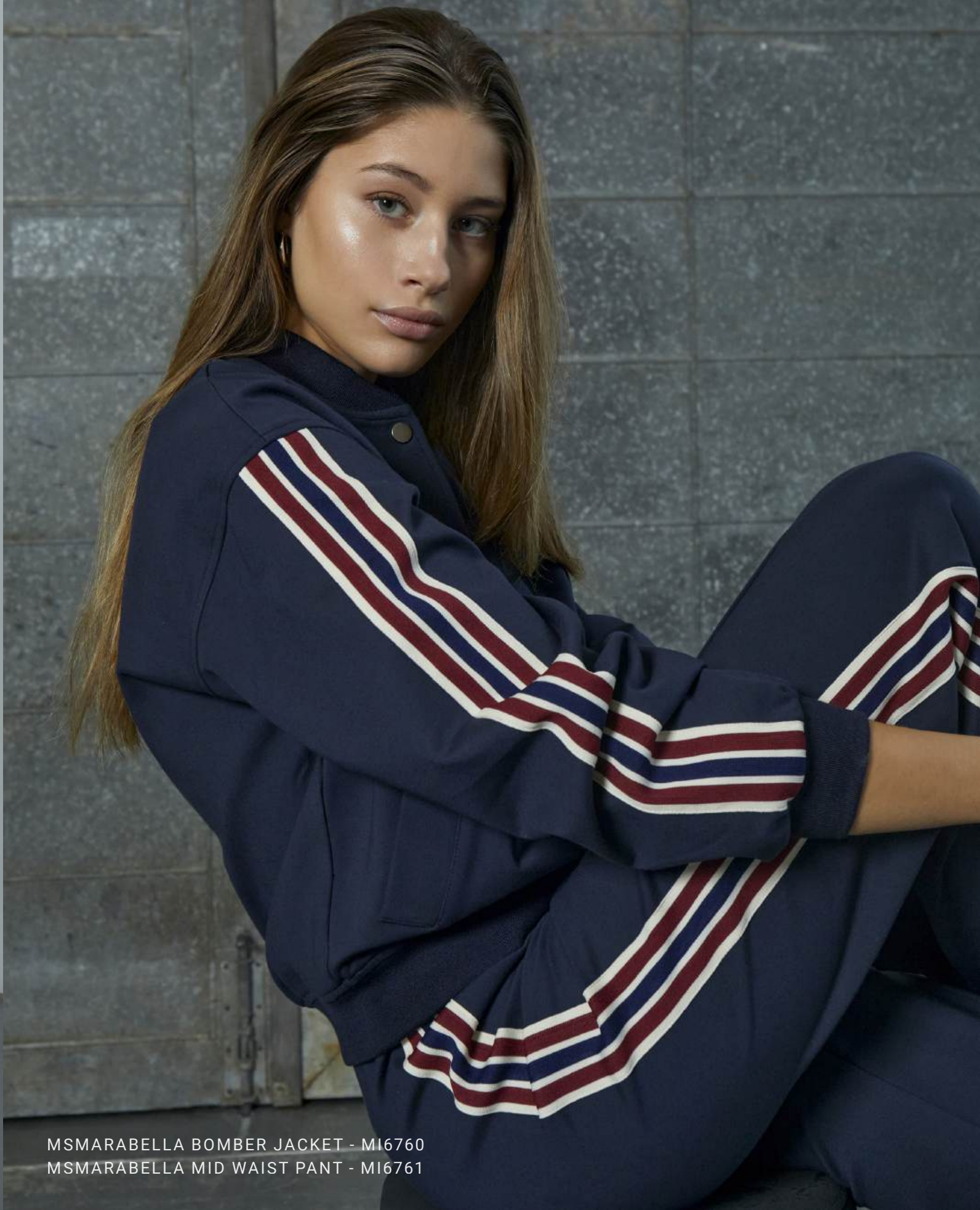
MSMARABELLA BOMBER JACKET - MI6760 MSMARABELLA MID WAIST PANT - MI6761